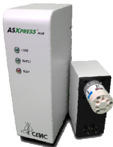
Figure 1. ASXPRESS ® PLUS Rapid Sample Introduction System

The CETAC ASXPRESS ® PLUS Rapid Sample Introduction System, when coupled to a CETAC autosampler, optimizes sample introduction by significantly increasing sample throughput and reducing costs of materials, power, maintenance and labor for ICP-MS analysis. The system is designed to allow multiple functions to occur simultaneously which would otherwise take place separately.