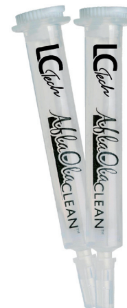
Immunoaffinity columns Afla-OtaCLEAN

The Afla-OtaCLEAN columns are also suitable for difficult matrices to purify both toxin groups in one operation. In this way, time and money can be saved and the product quality can be significantly improved, especially in the area of spices.